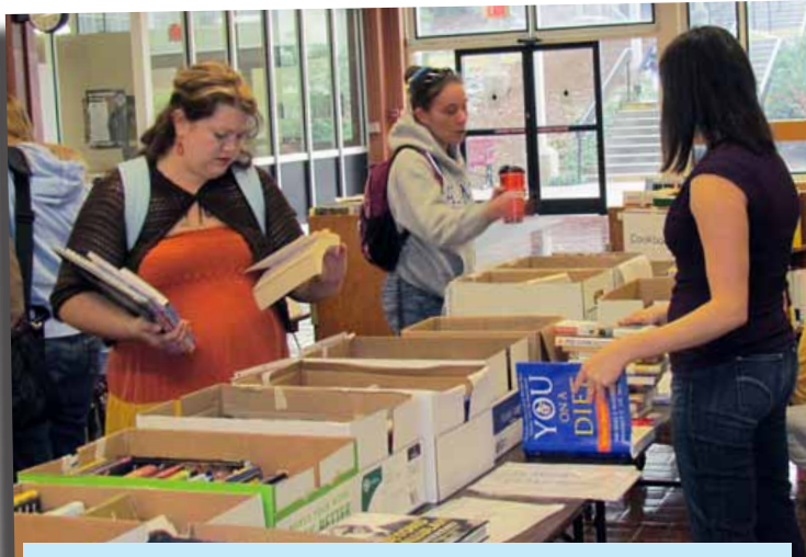
Literary lovers at last week's 8th ANNUAL JEAN SLAUGHTER MEMORIAL SCHOLARSHIP BOOK SALE added $1502.83 to the fund for university transfer students. One hundred percent of money raised in the sale is contributed to the ACC Foundation scholarship named for an English instructor who died in 2004.